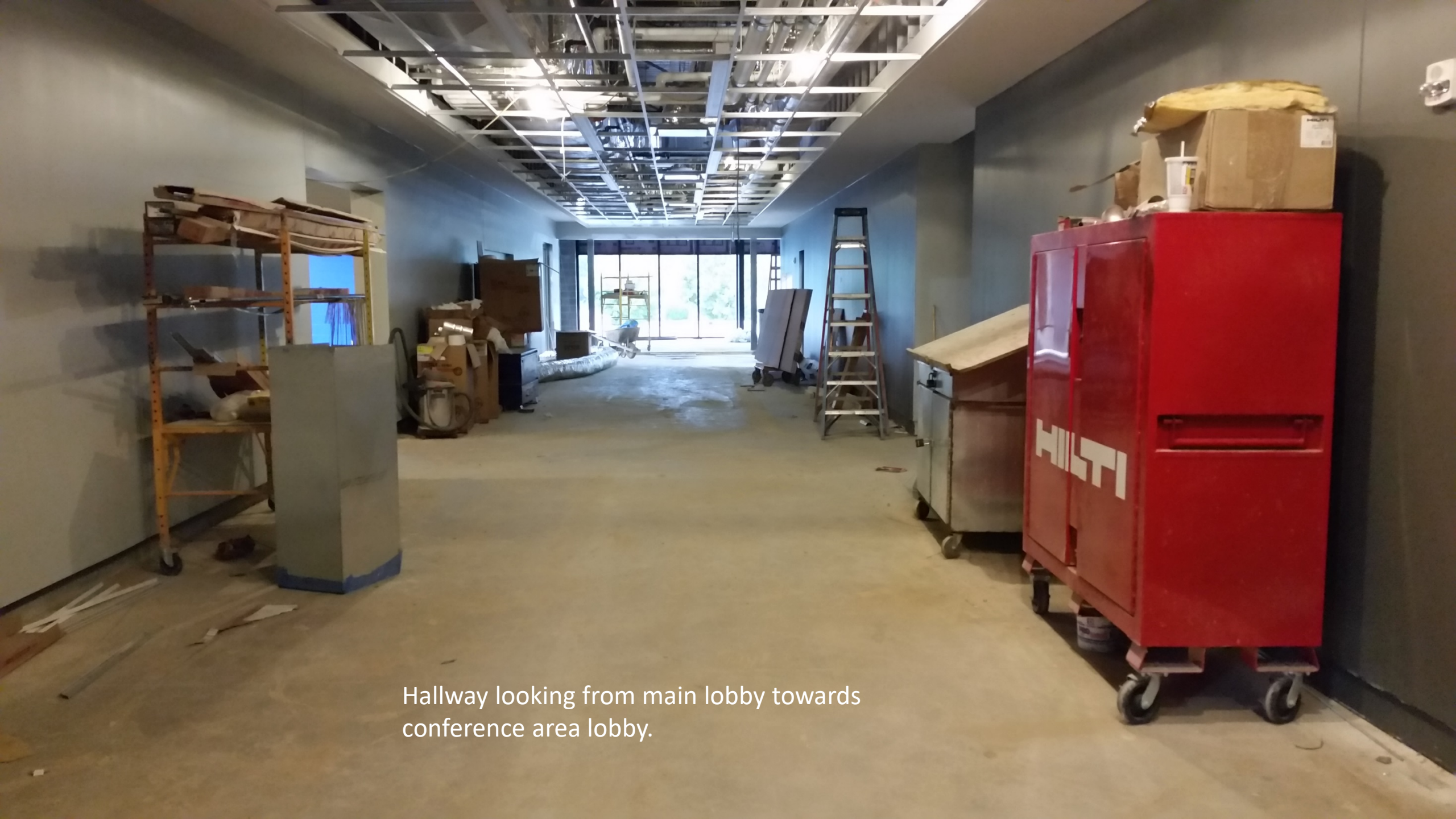
Hallway looking from main lobby towards conference area lobby.