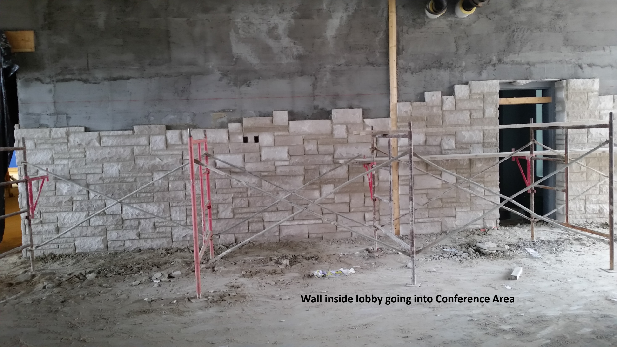
Wall inside lobby going into Conference Area