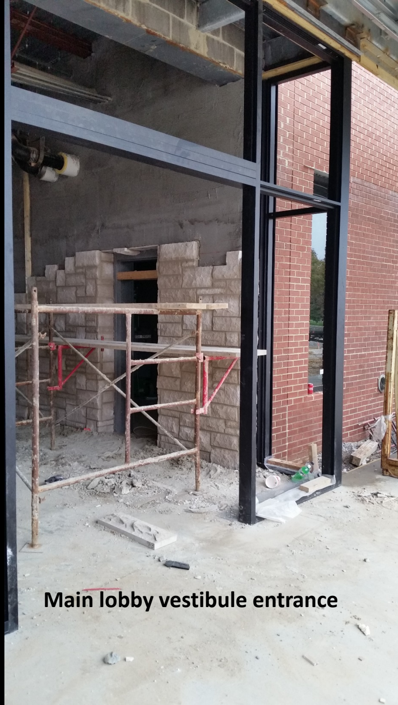
Main lobby vestibule entrance