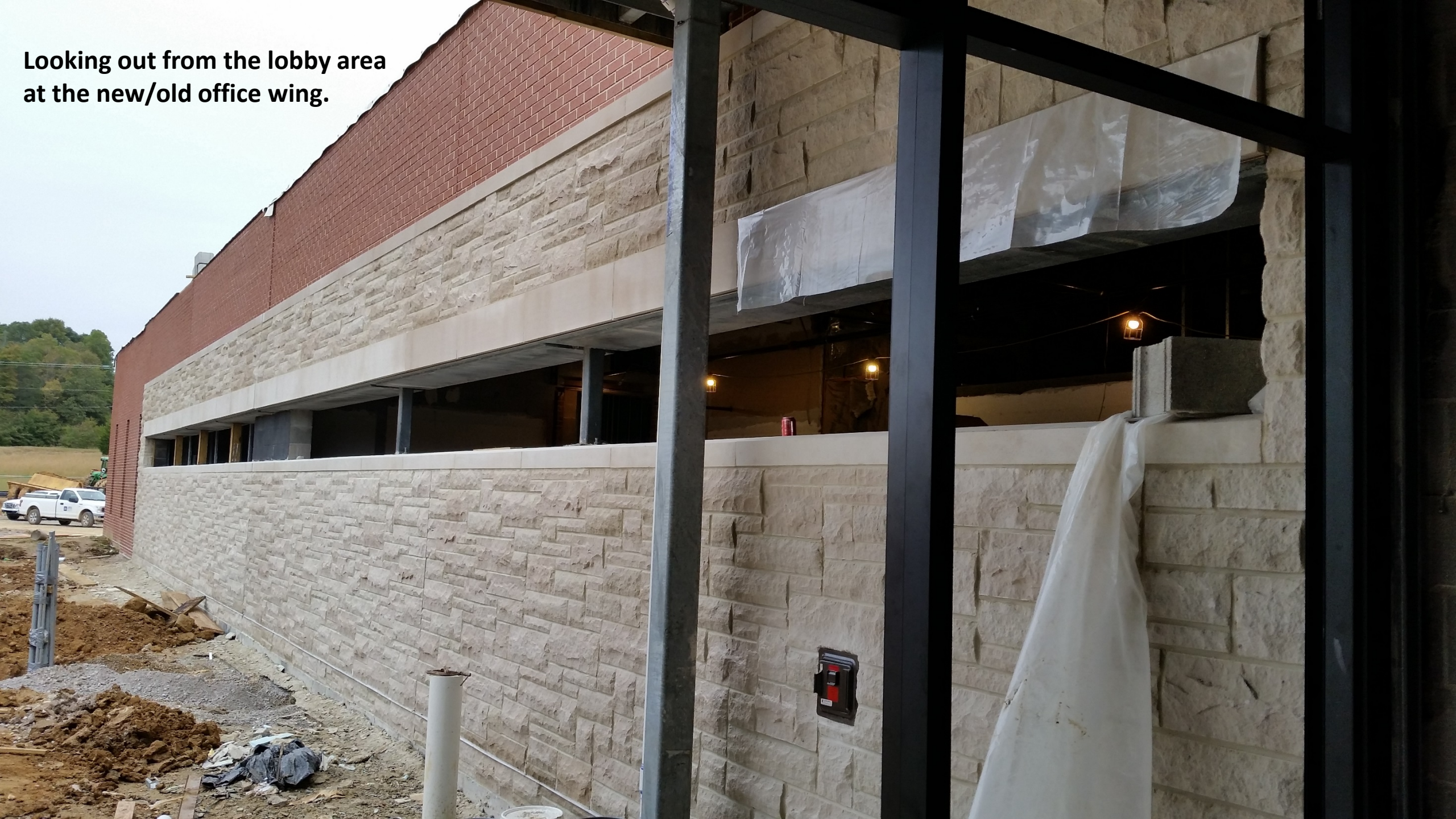
Looking out from the lobby area at the new/old office wing.