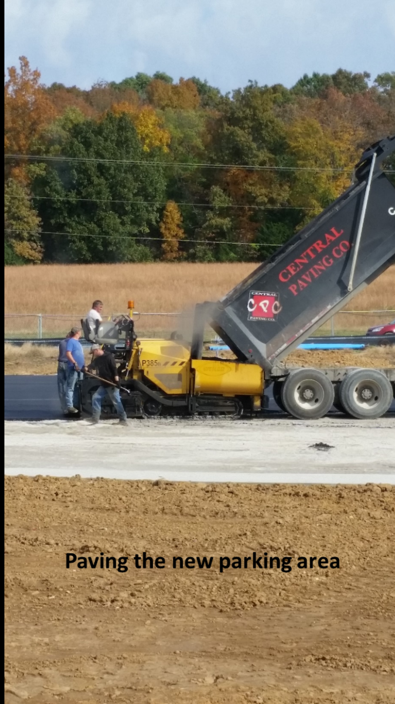
Paving the new parking area