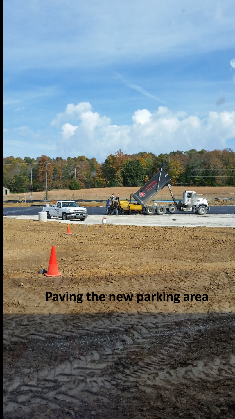
Paving the new parking area