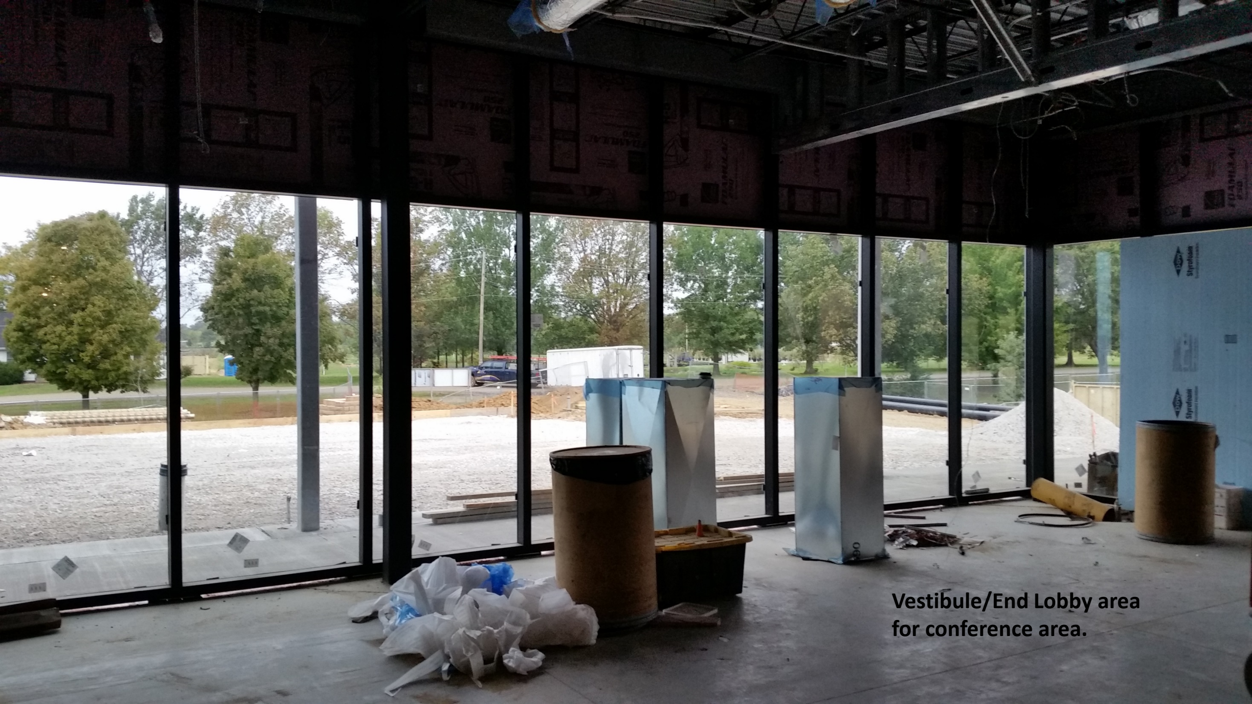
Vestibule/End Lobby area for conference area.