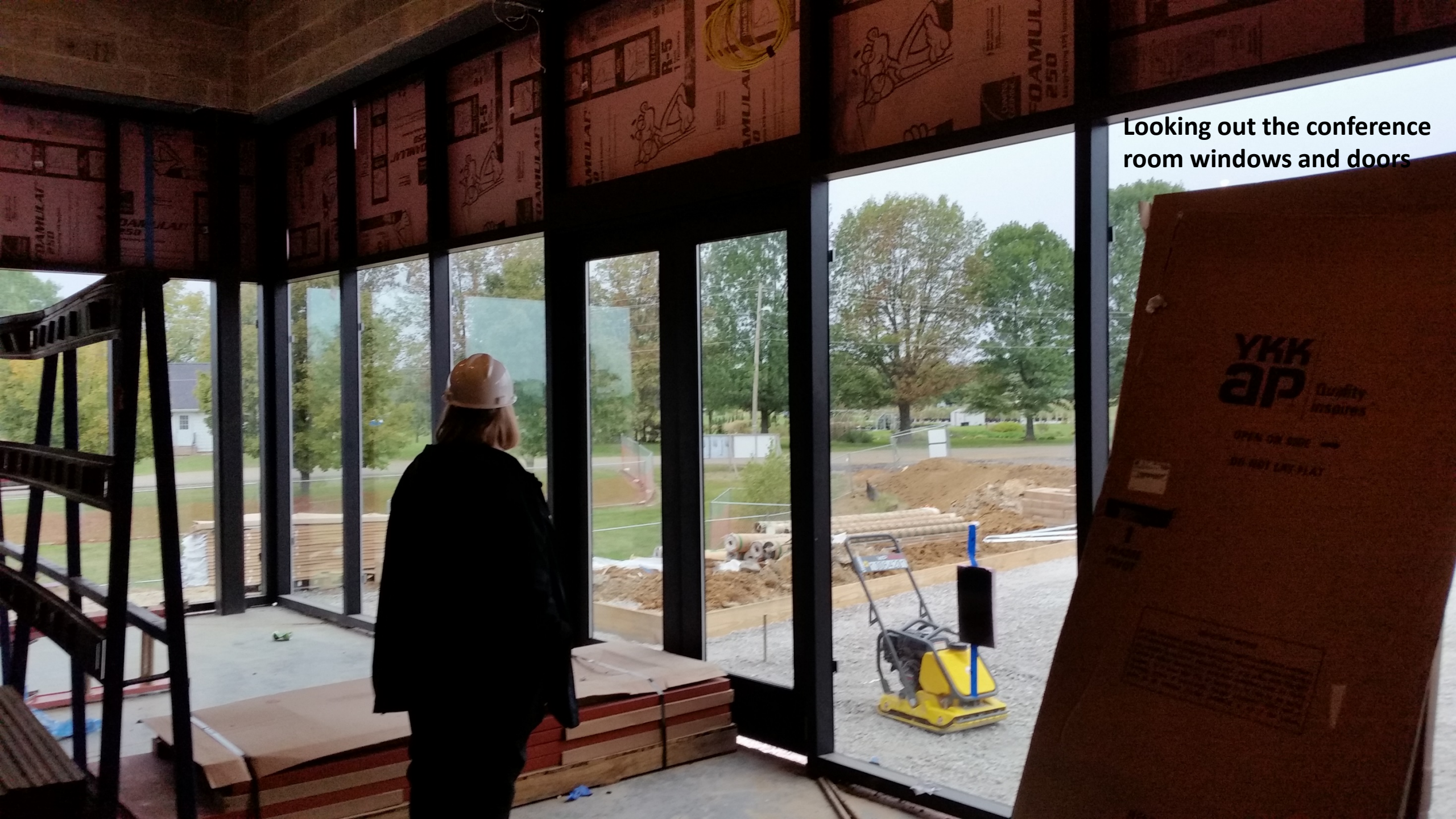
Looking out the conference room windows and doors