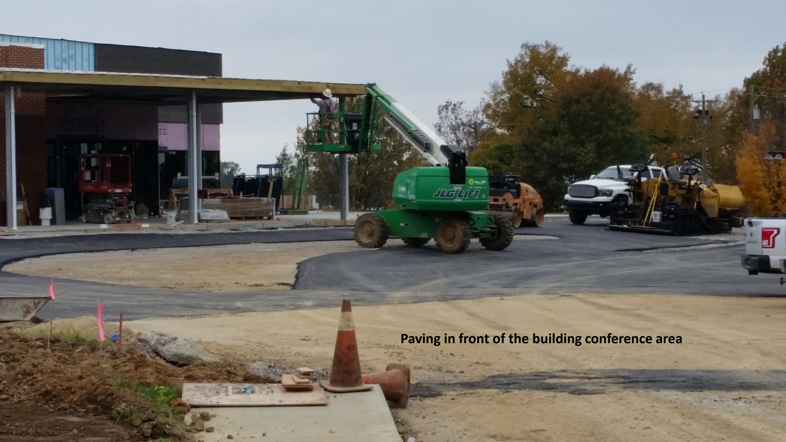
Paving in front of the building conference area