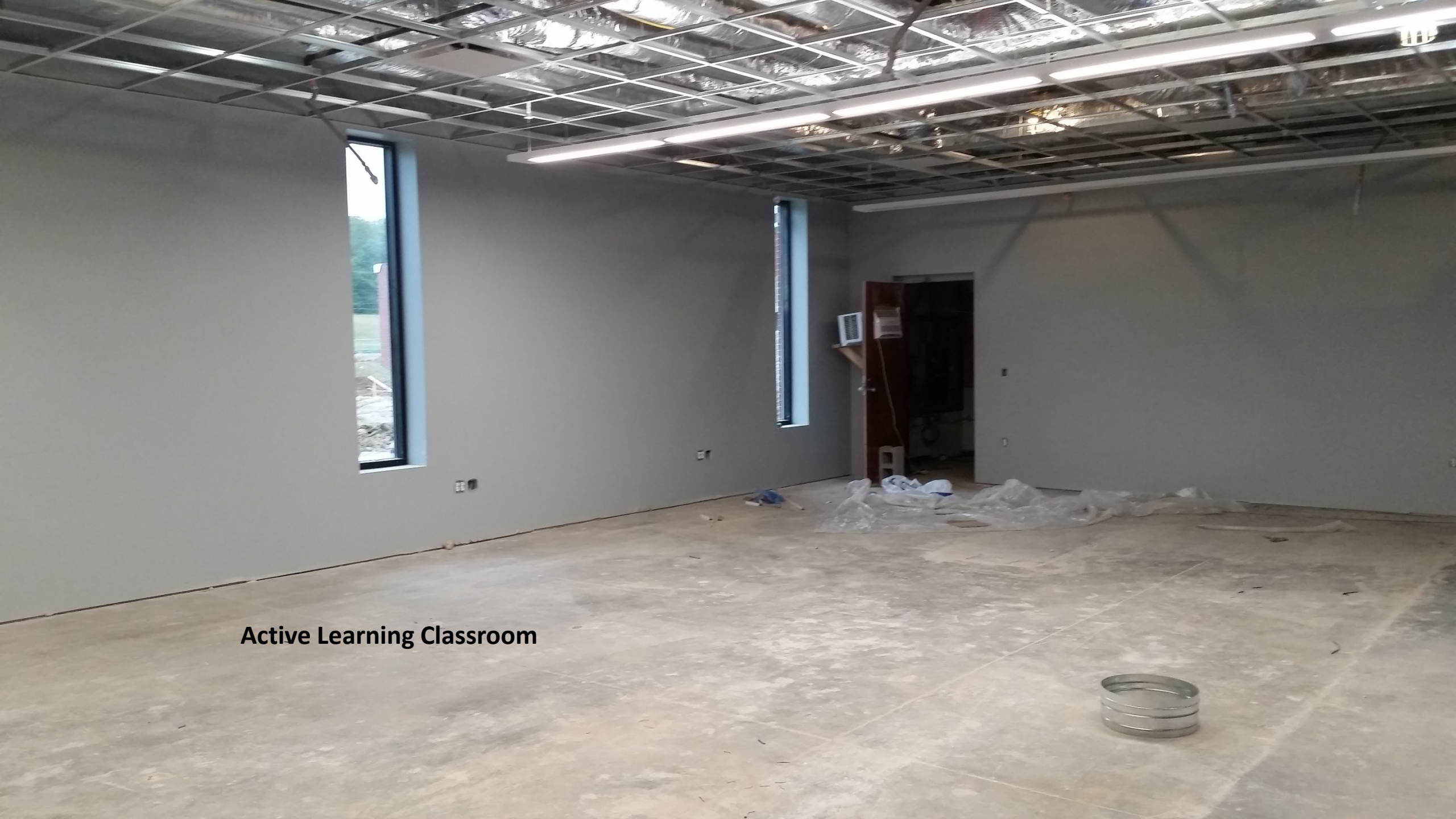
Active Learning Classroom