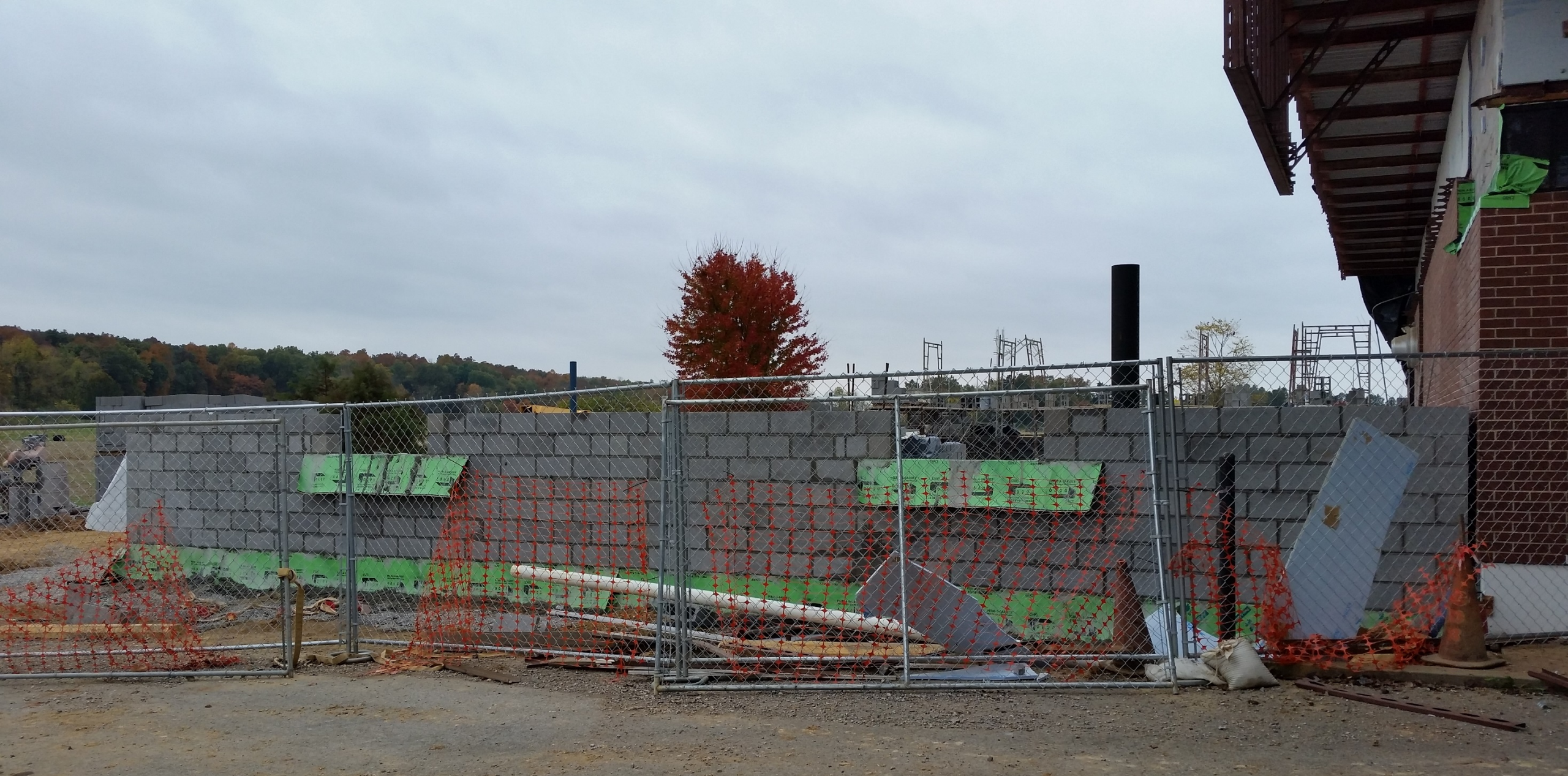
Starting to put up the walls to the new laboratory area