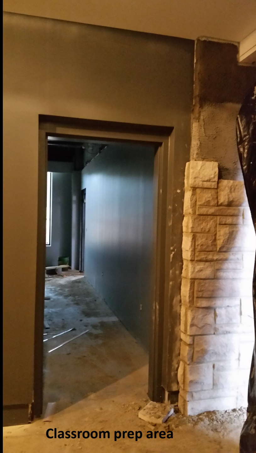
Classroom prep area