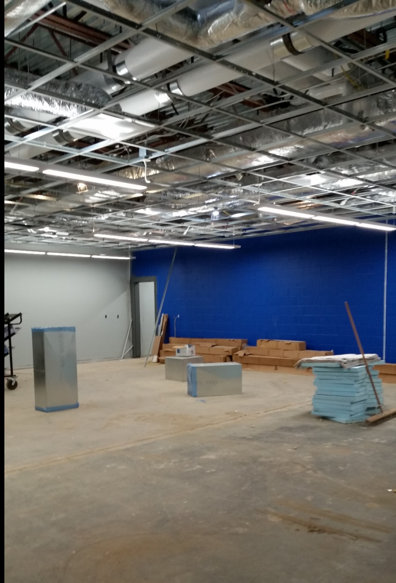
Walls painted gray and blue in the demonstration classroom.