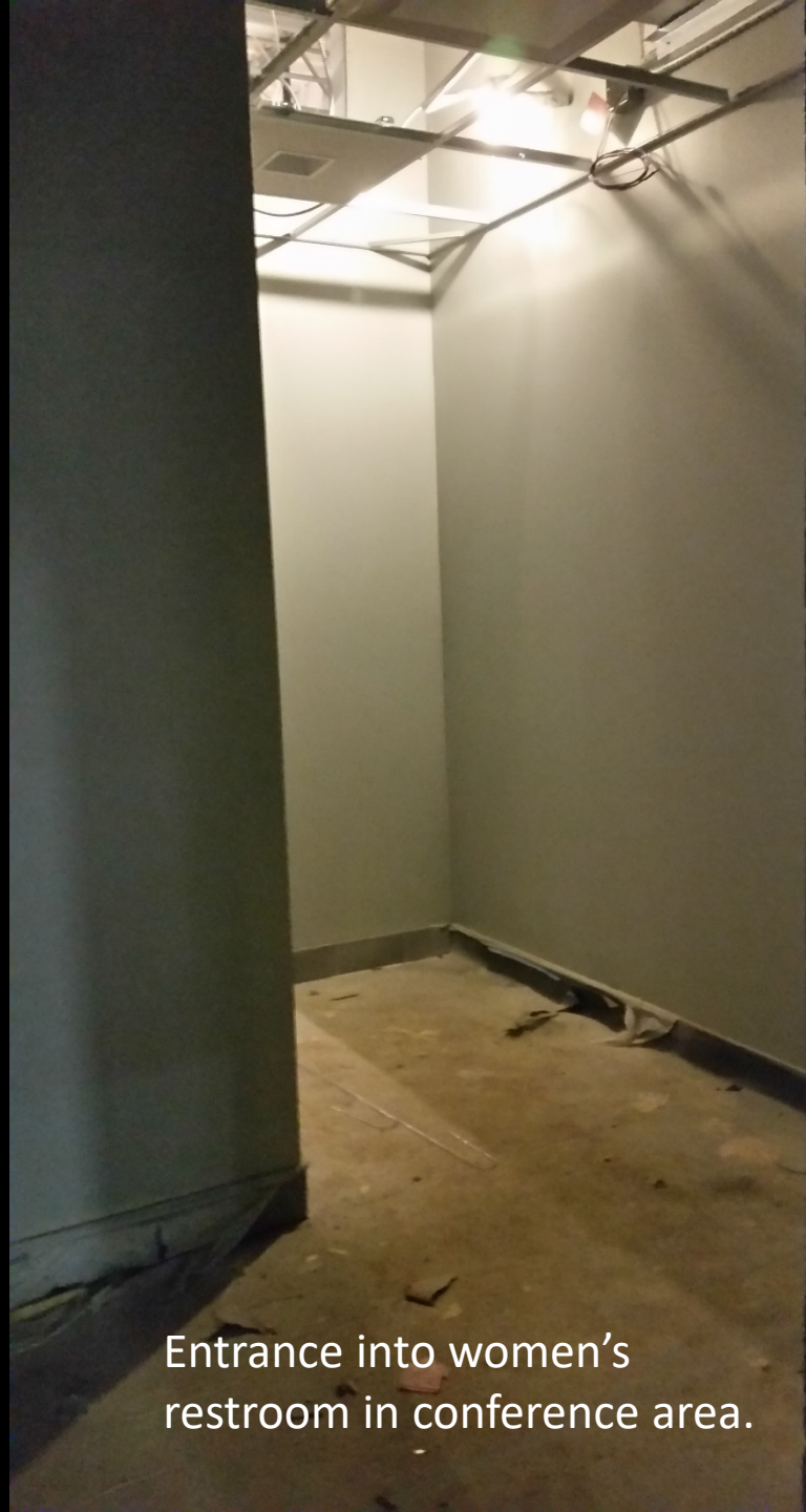
Entrance into women's restroom in conference area.