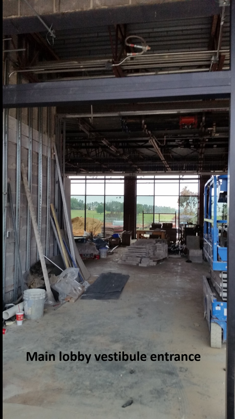
Main lobby vestibule entrance