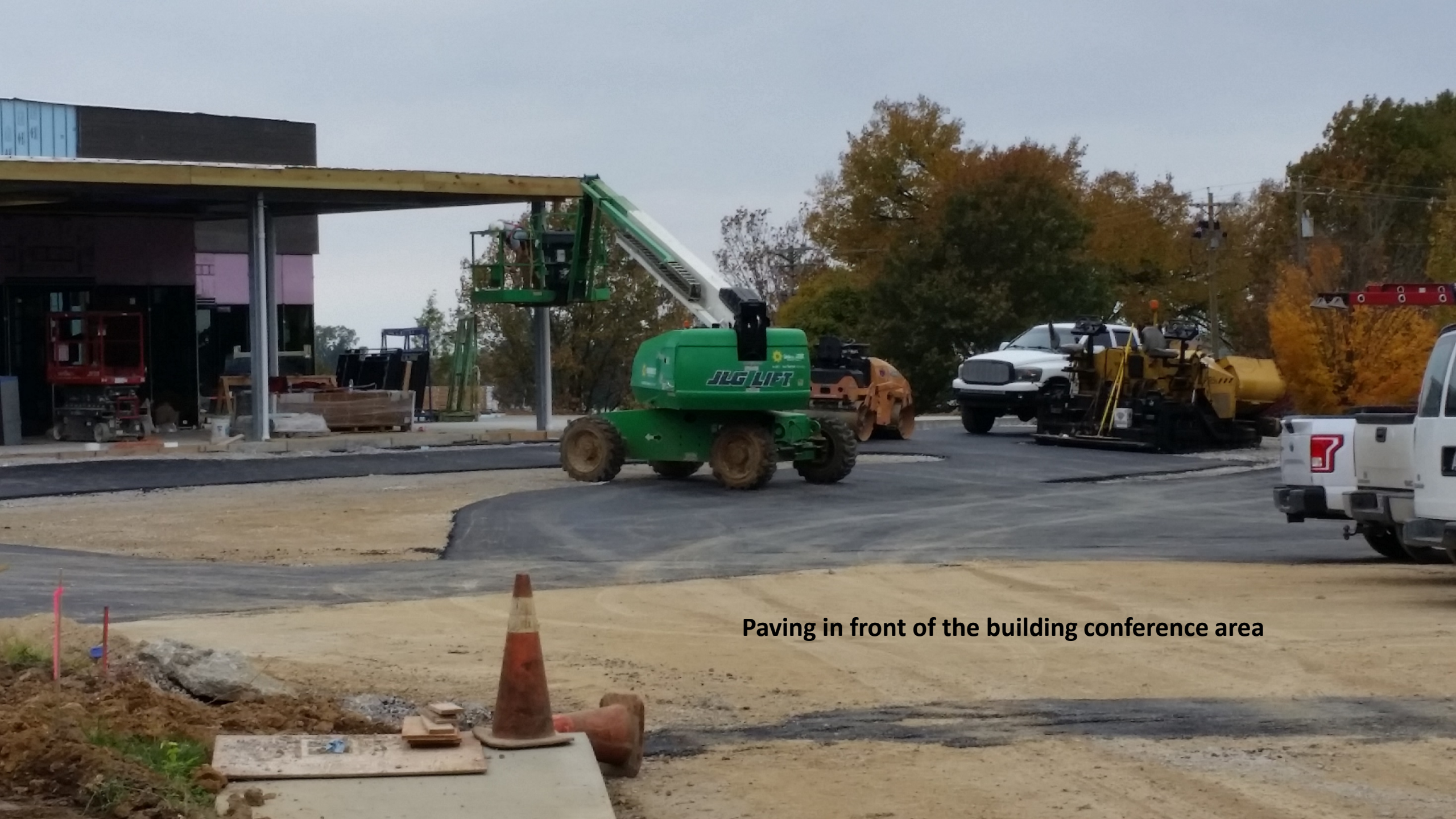
Paving in front of the building conference area