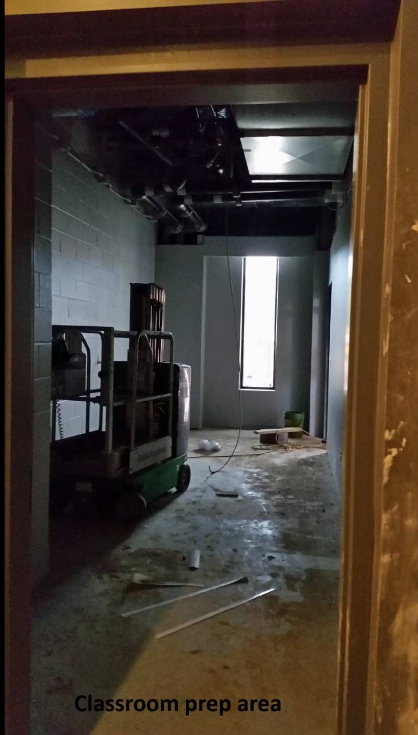
Classroom prep area