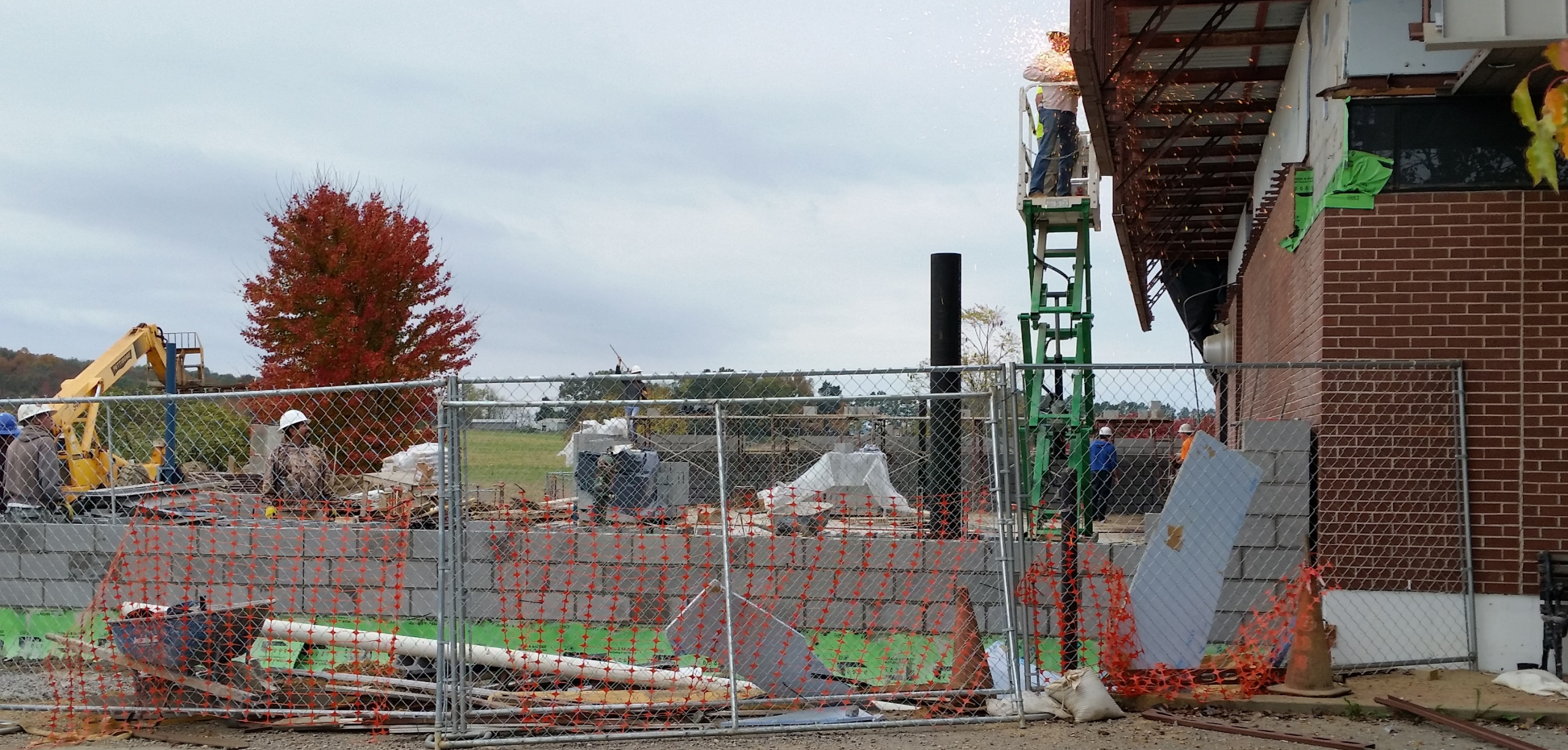
Starting to put up the walls to the new laboratory area