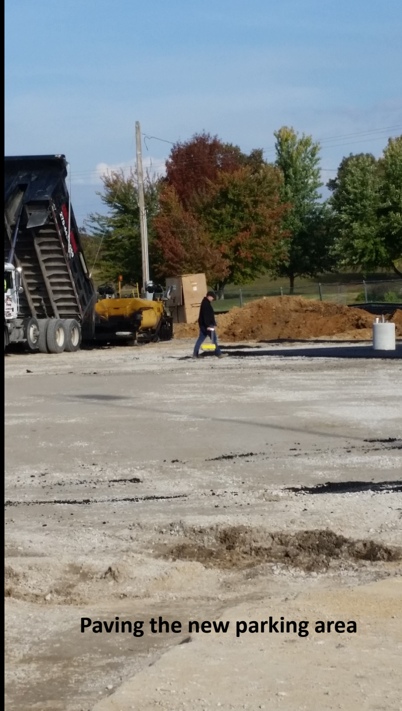
Paving the new parking area