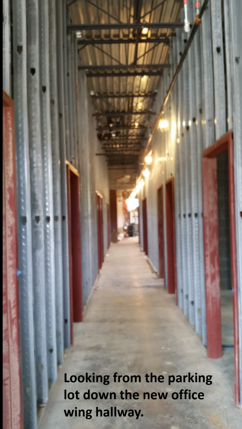
Looking from the parking lot down the new office wing hallway.