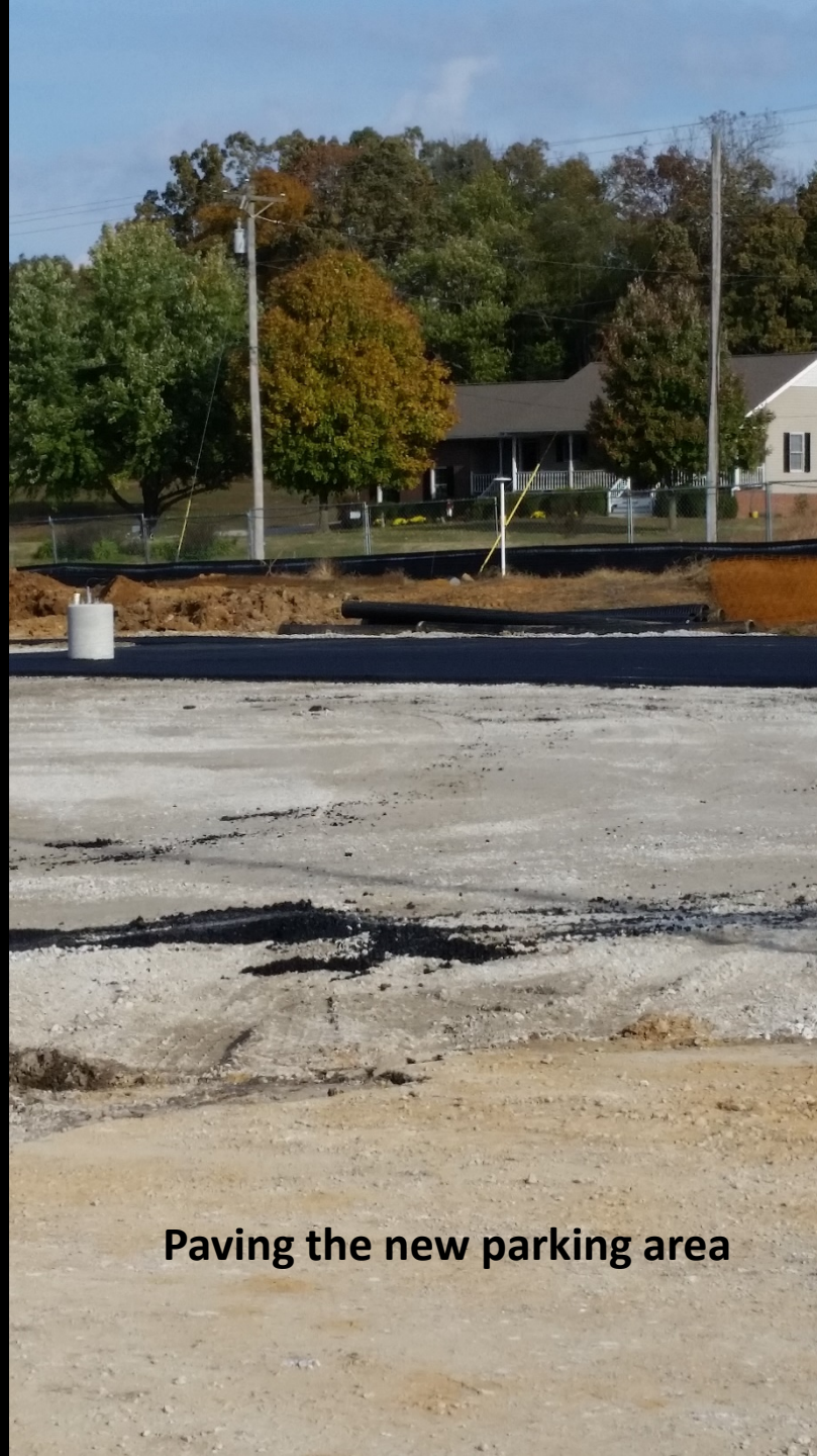
Paving the new parking area