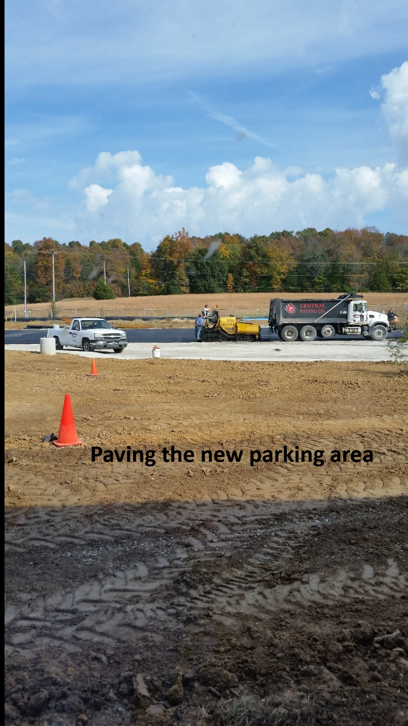
Paving the new parking area