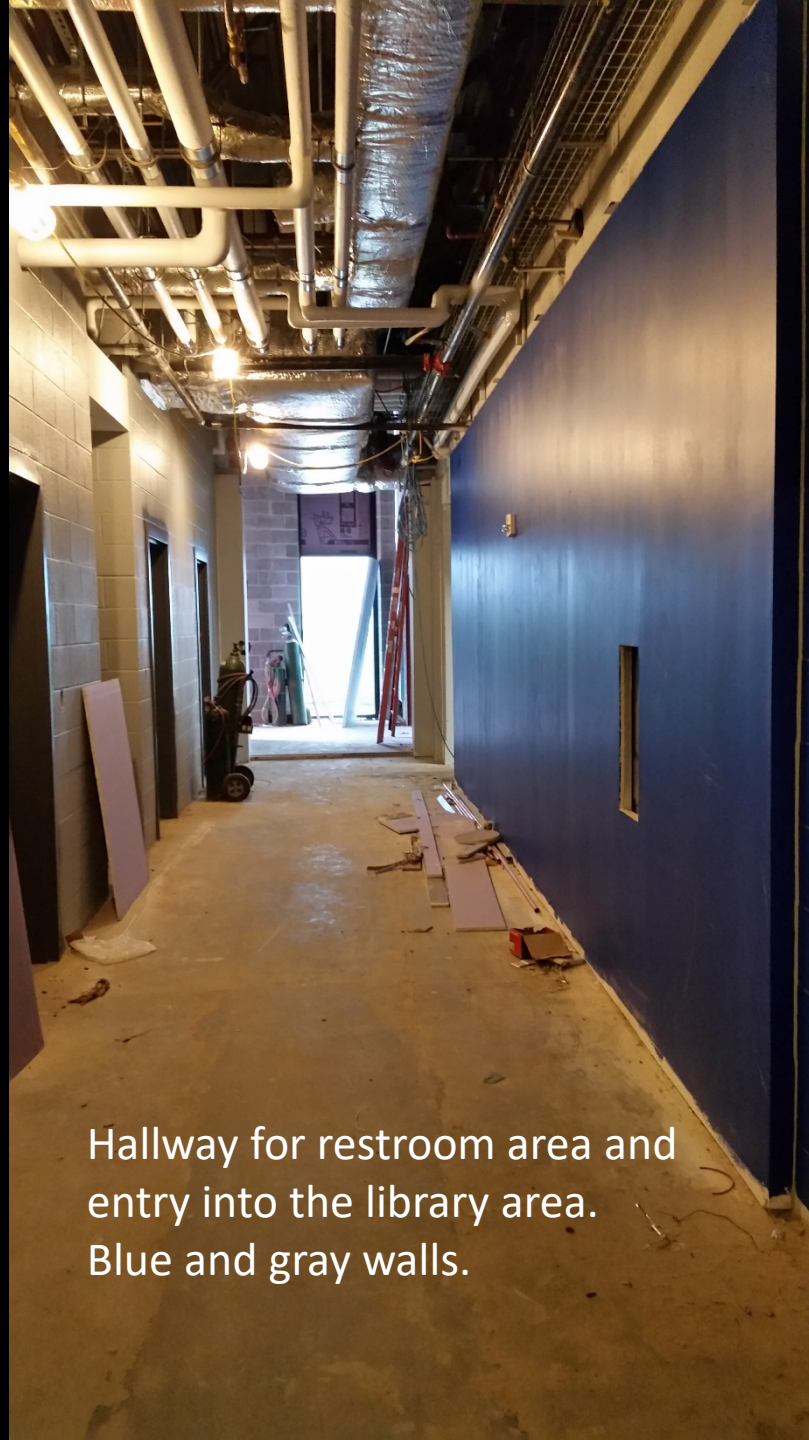
Hallway for restroom area and entry into the library area. Blue and gray walls.