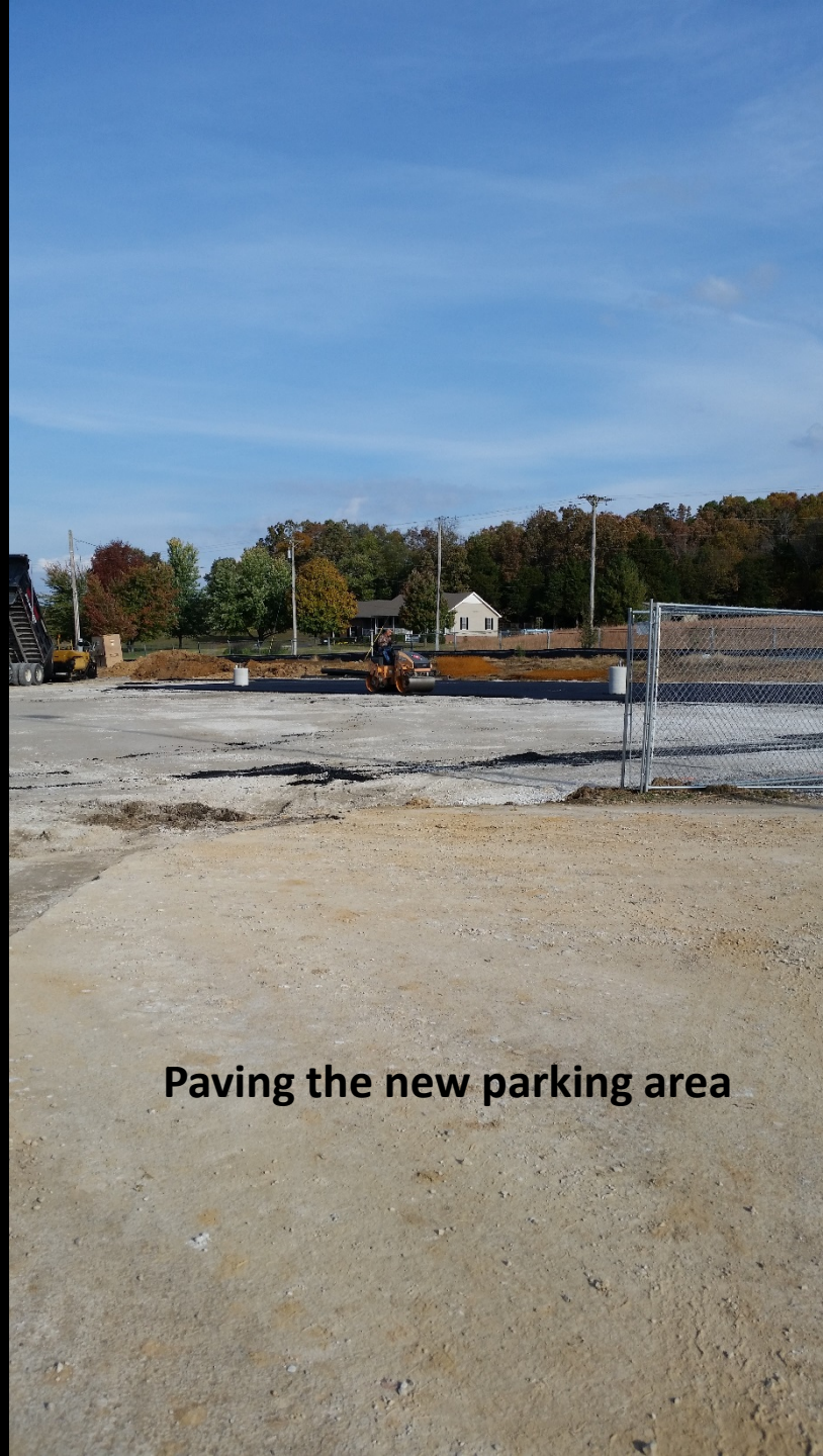
Paving the new parking area