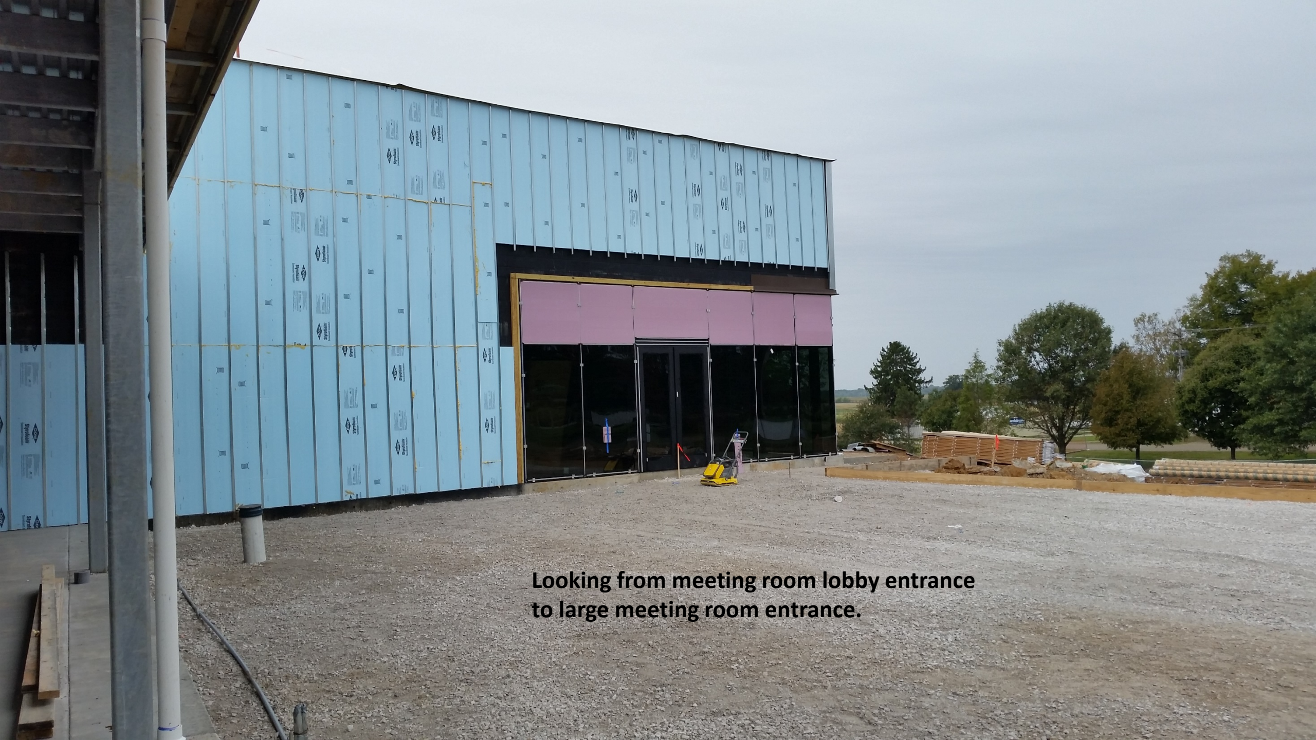
Looking from meeting room lobby entrance to large meeting room entrance.