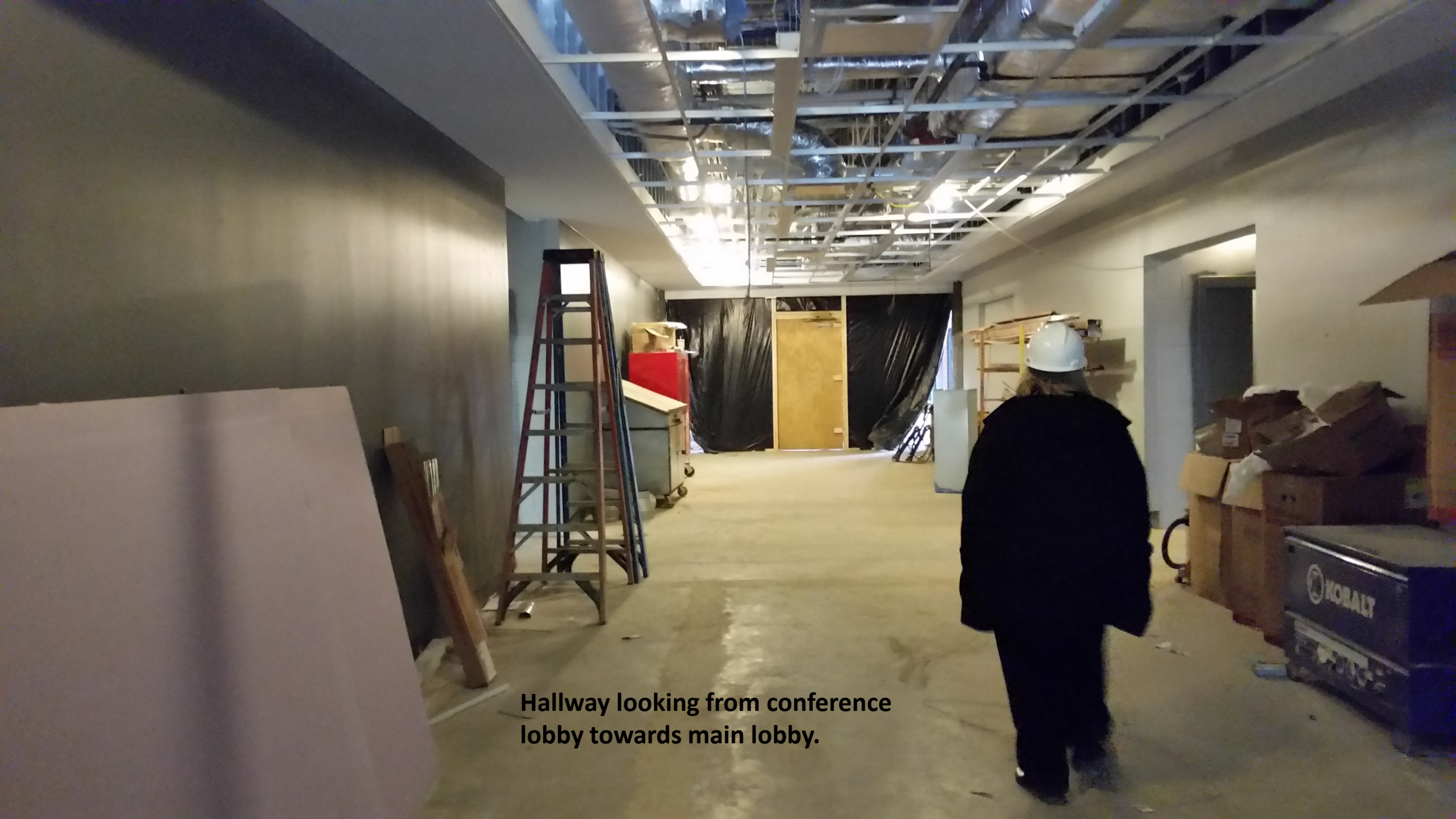
Hallway looking from conference lobby towards main lobby.