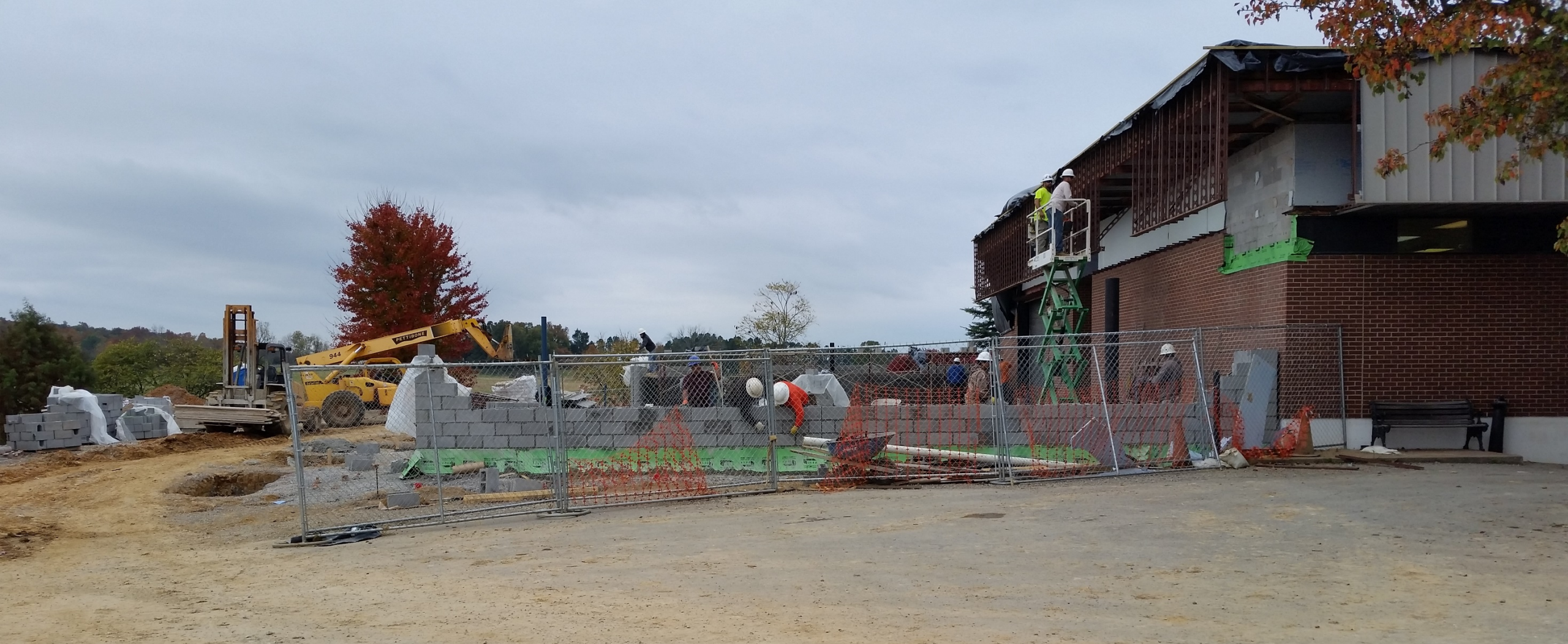
Starting to put up the walls to the new laboratory area