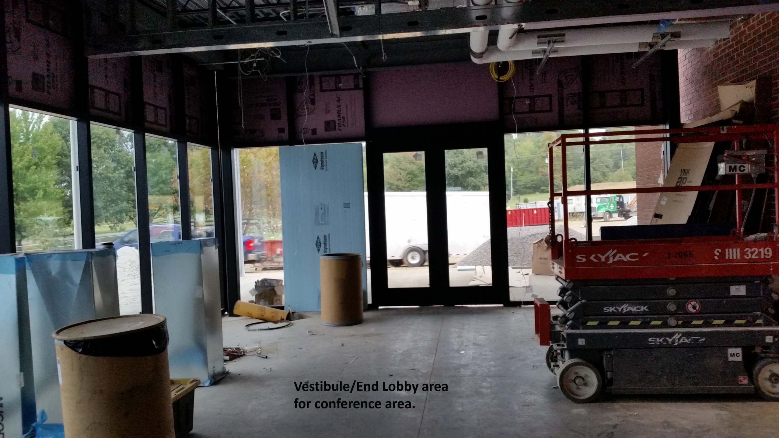
Vestibule/End Lobby area for conference area.