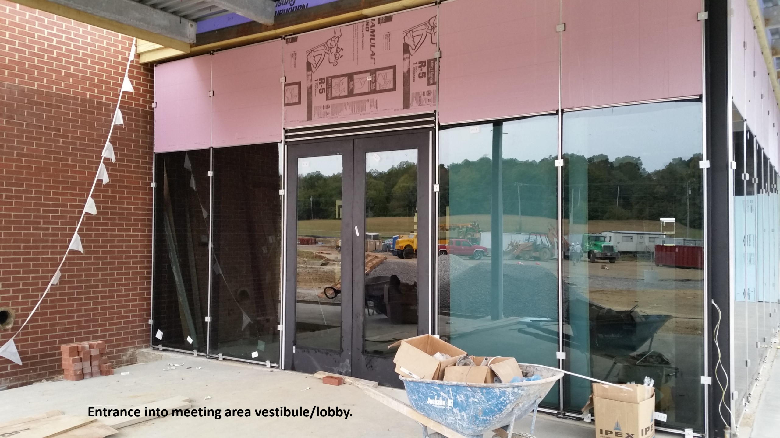
Entrance into meeting area vestibule/lobby.