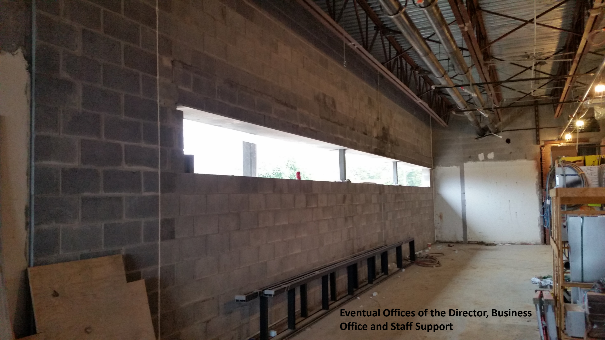
Eventual Offices of the Director, Business Office and Staff Support