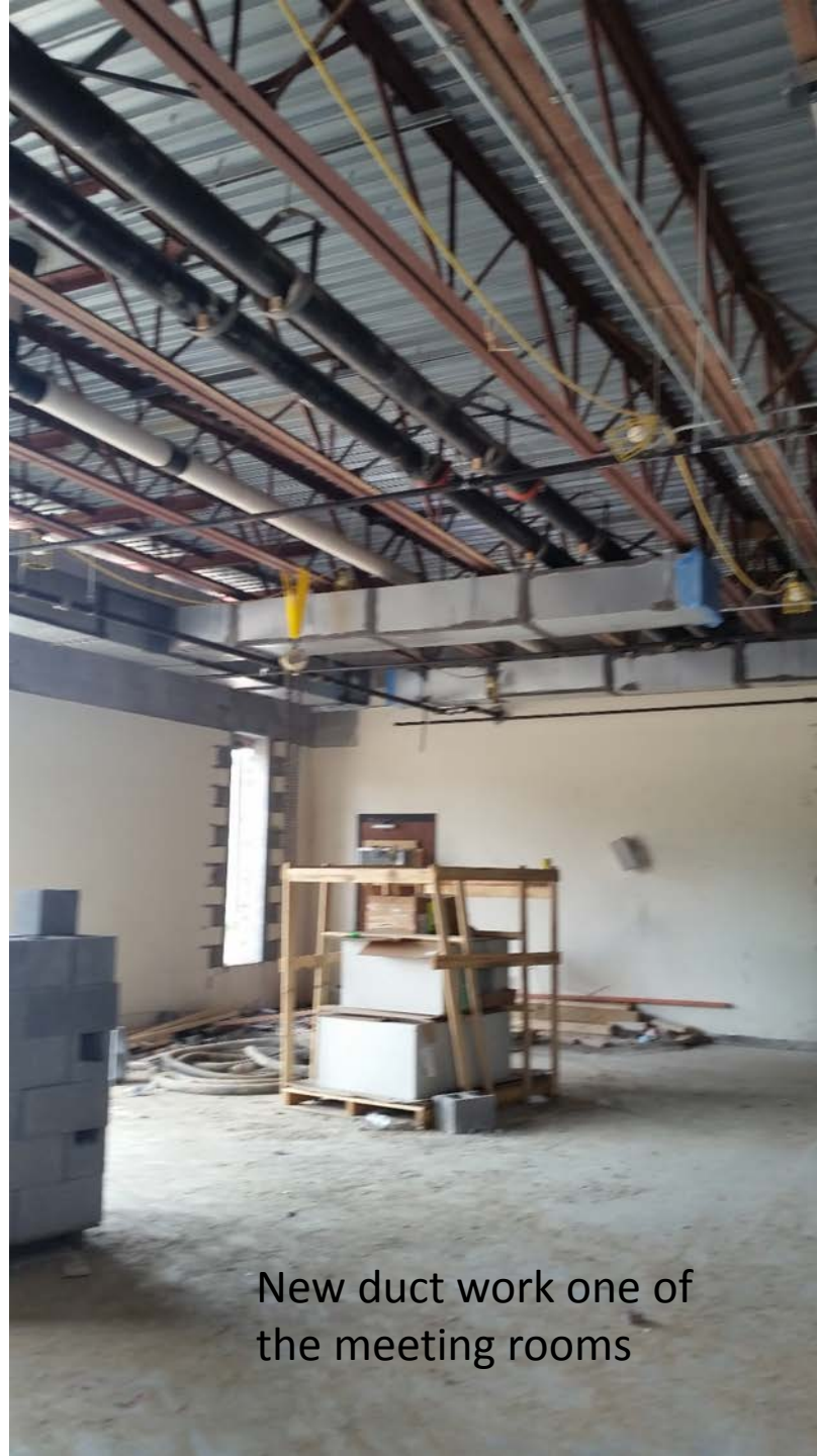
New duct work one of the meeting rooms