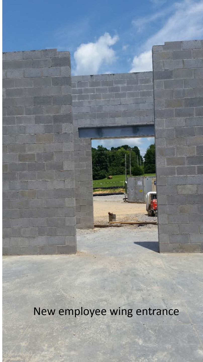
New employee wing entrance