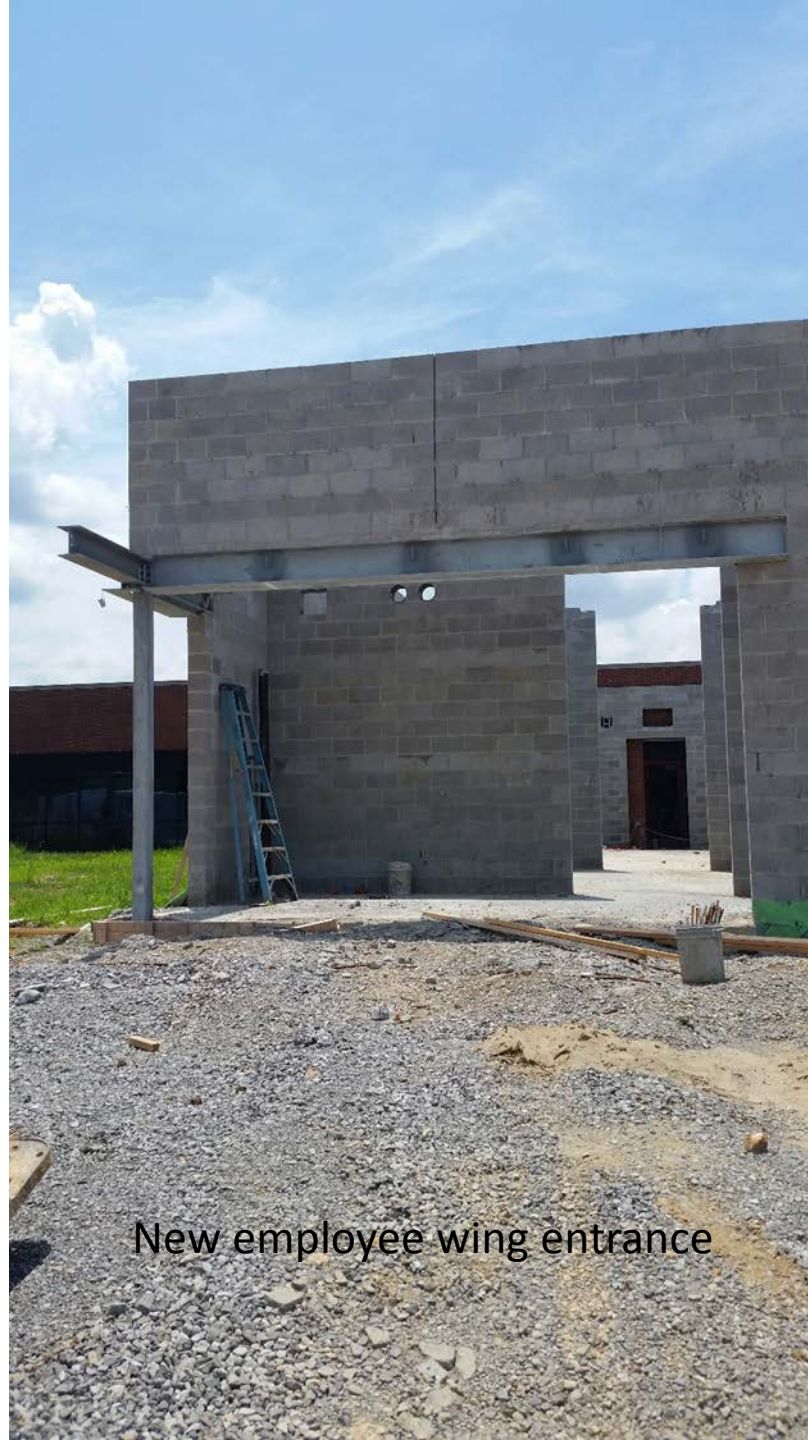
New employee wing entrance