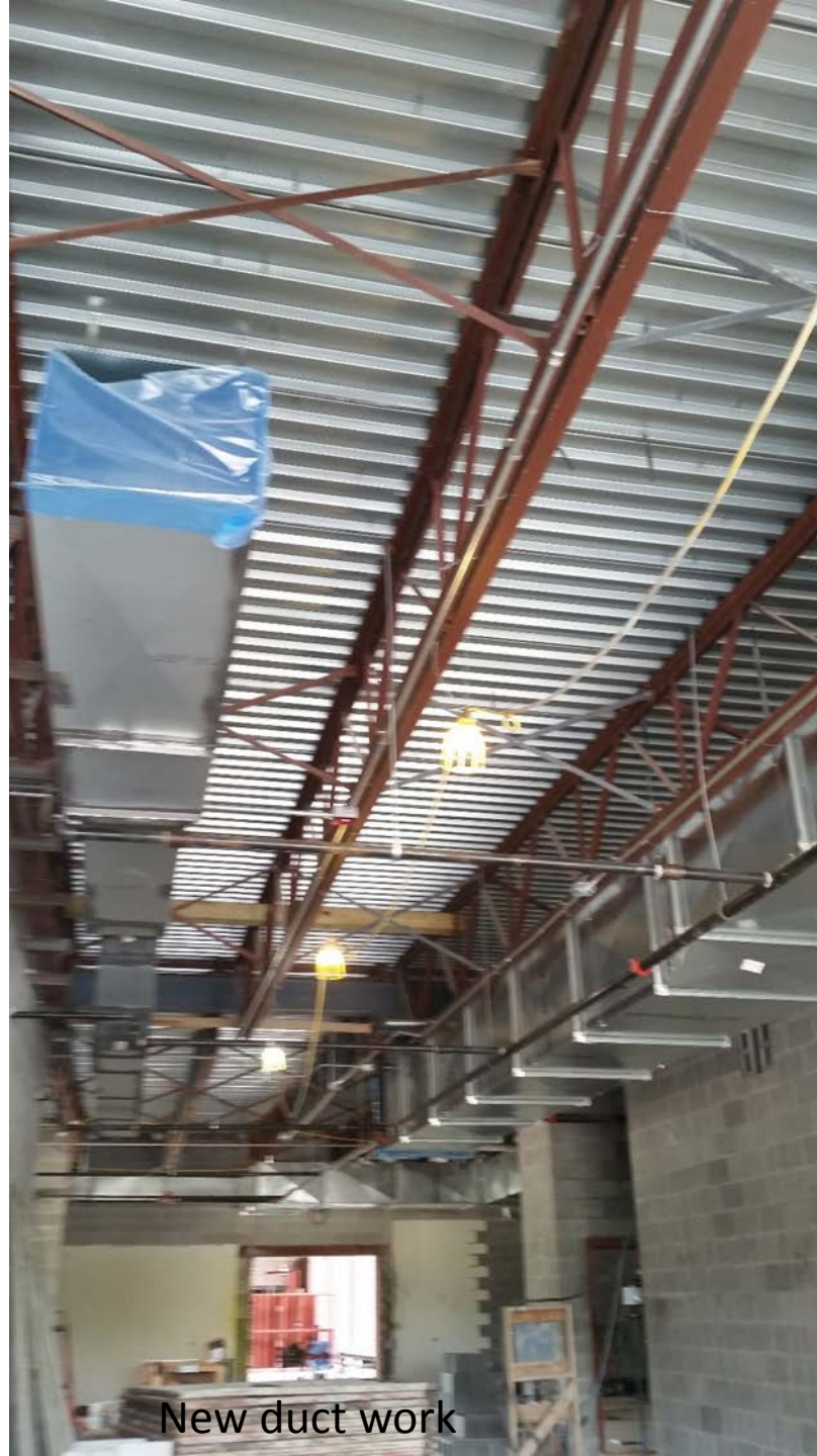
New duct work