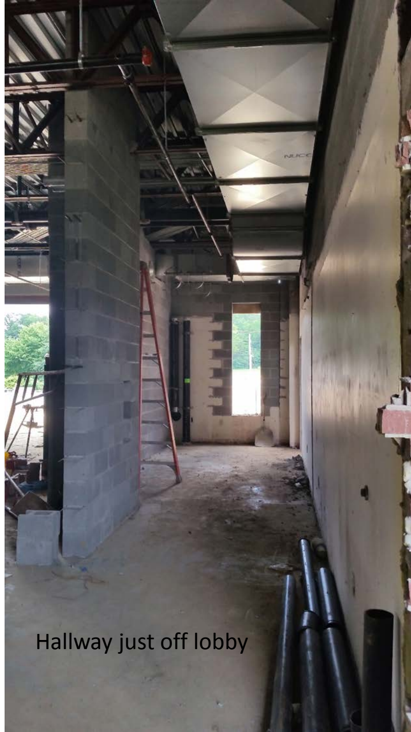
Hallway just off lobby