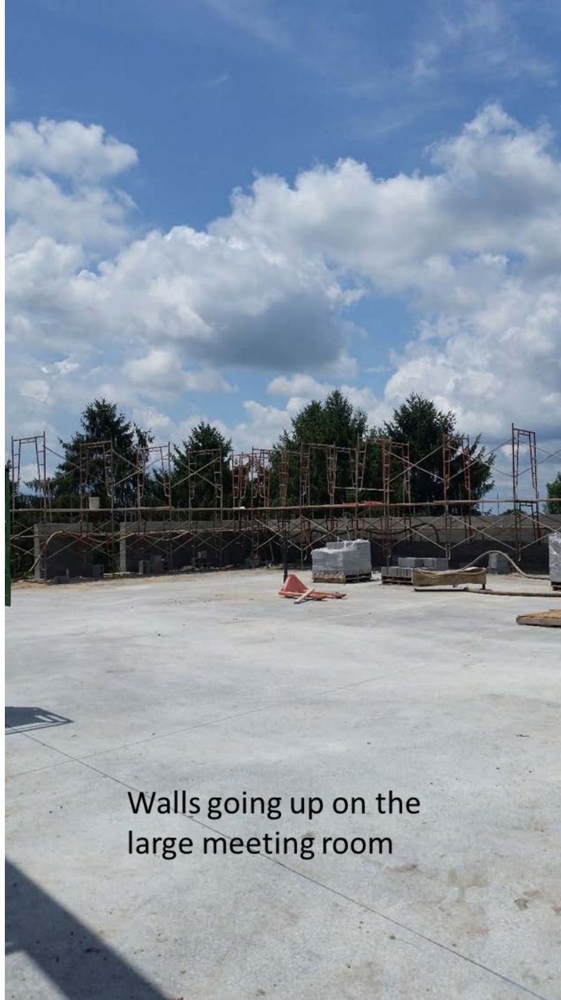
Walls going up on the large meeting room