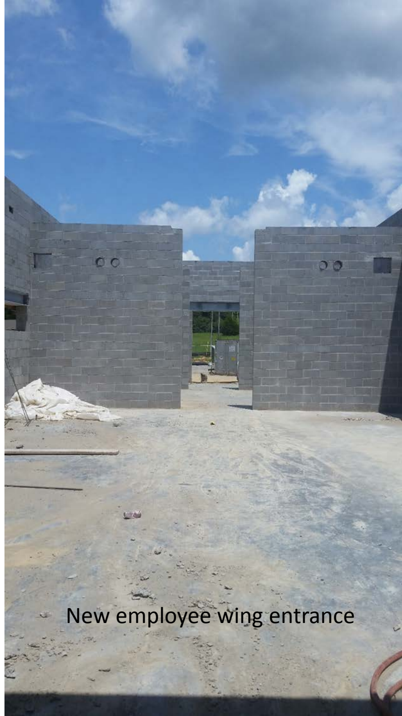
New employee wing entrance