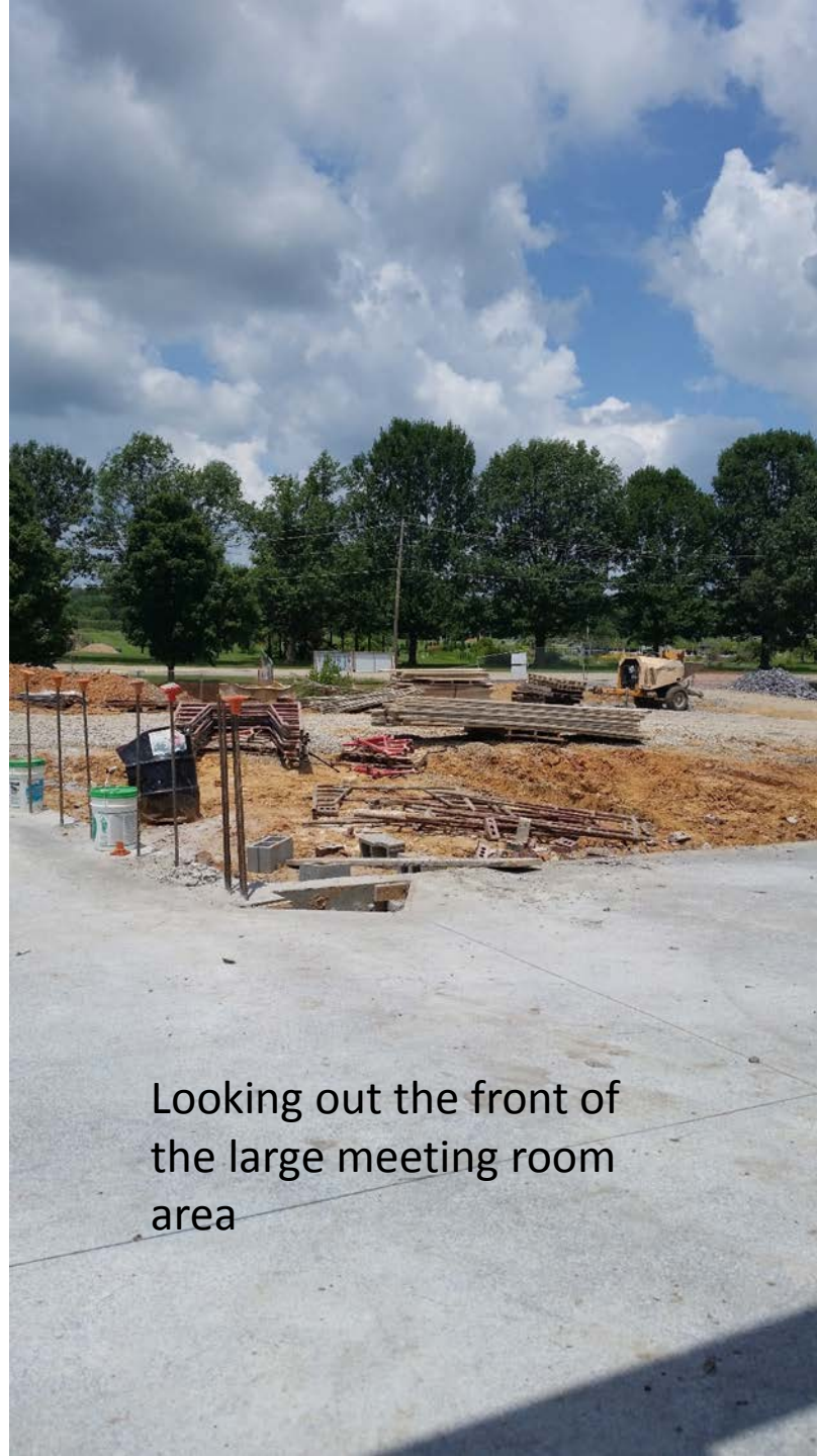
Looking out the front of the large meeting room area