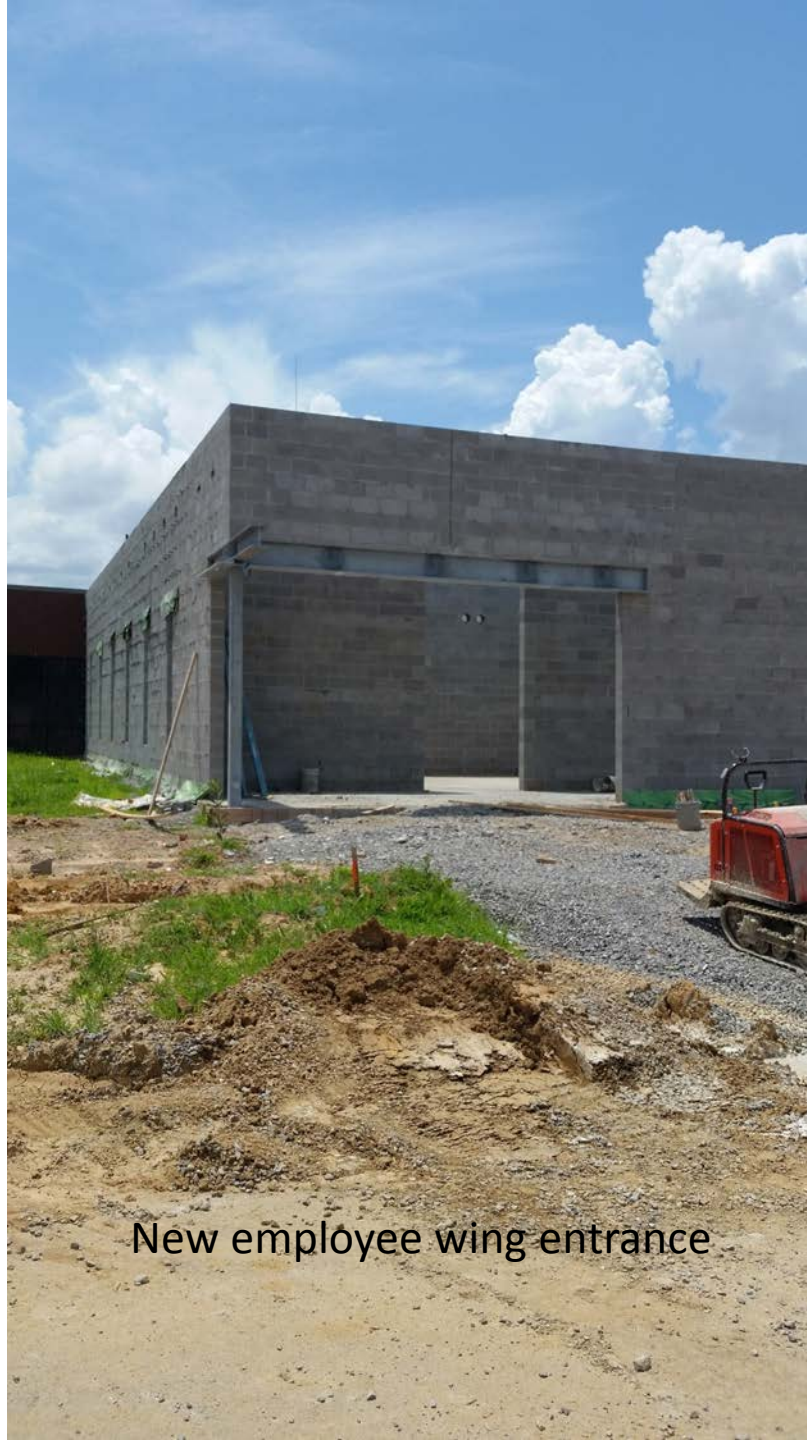
New employee wing entrance