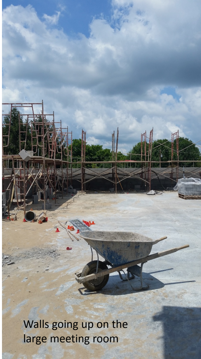
Walls going up on the large meeting room