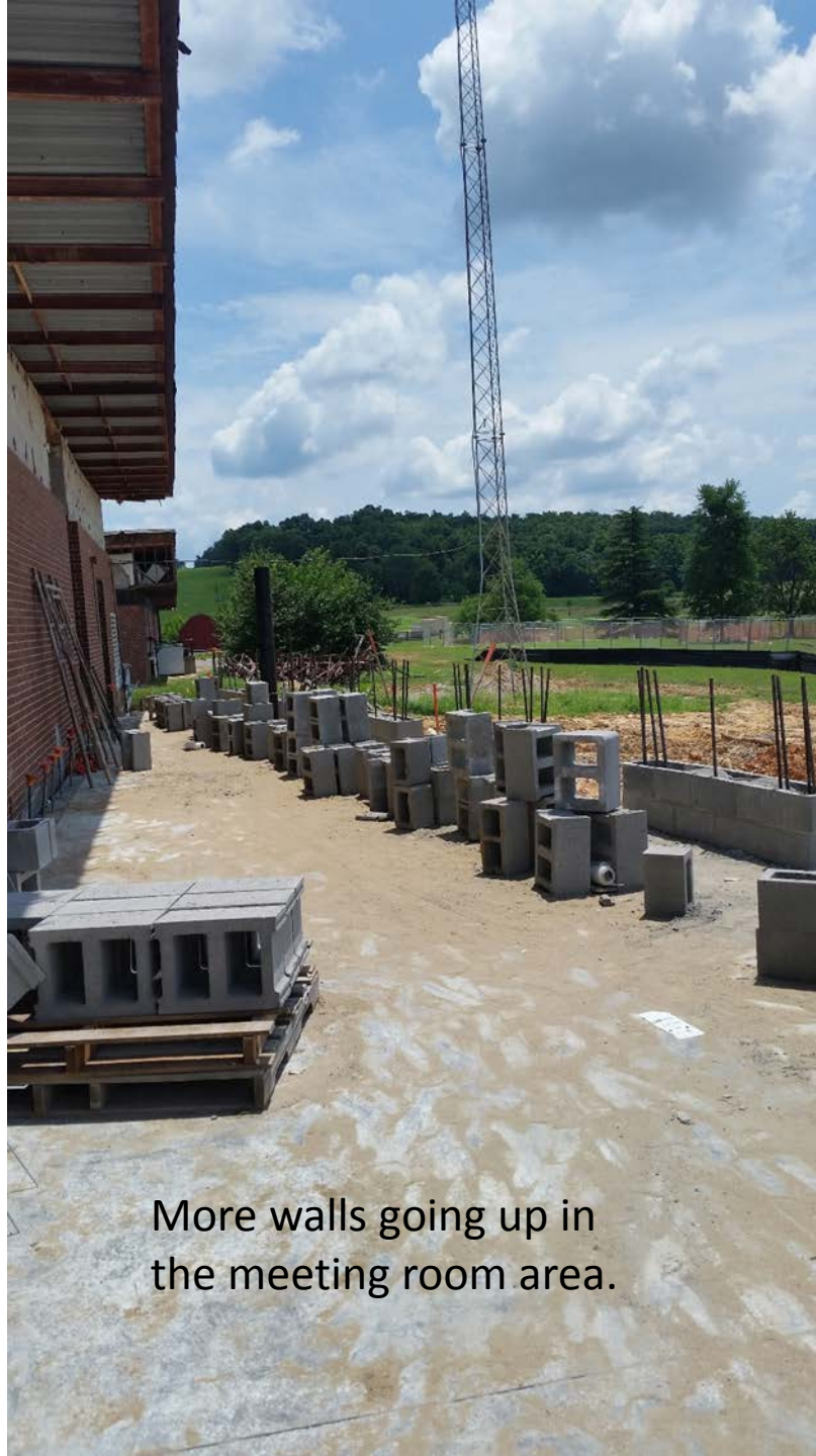
More walls going up in the meeting room area.