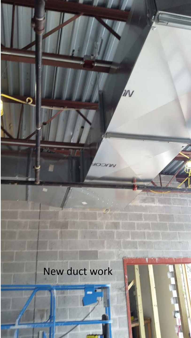
New duct work